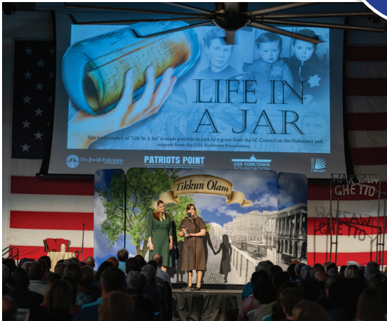
Life in a Jar: the Irena Sendler Project in honor of Holocaust Remembrance Day