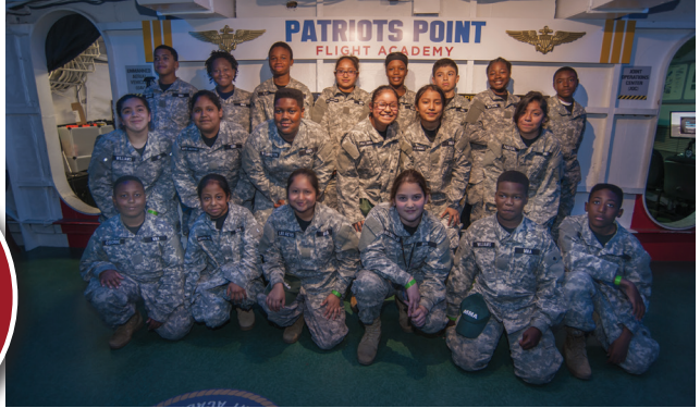
Scholarship students in the Flight Academy