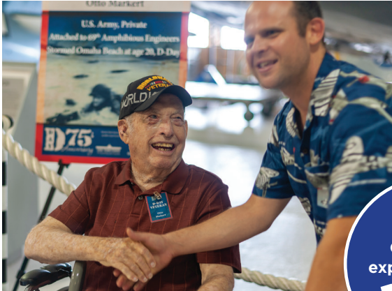
75th Anniversary of D-Day, welcoming 9 D-Day Veterans

The Foundation provided funding for 12 new or upgraded exhibits at the Museum, including a fully operational radial engine to demonstrate how engines work, and the restoration and presentation of the USS Laffey D-Day flag.